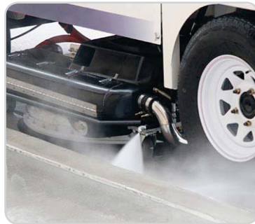
Integrated curb cleaner for the vertical faces of curbs.