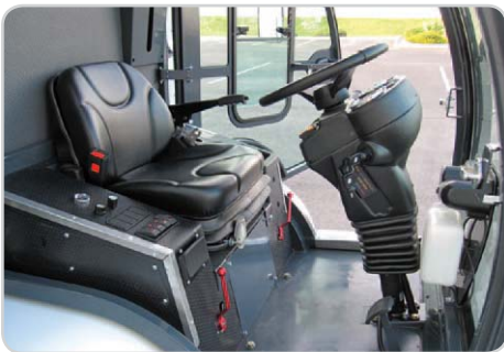
Comfortable, ergonomically designed cab with intuitive operator controls.