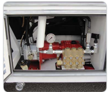
Easy access to high pressure water pump, adjustable from 800 to 4,350 psi.