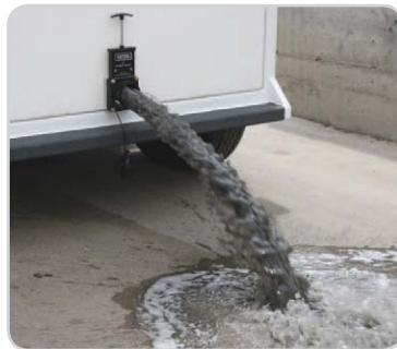
Large cap and 3 inch drain makes cleanup fast and simple.