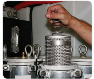
Four washable, lifetime stainless steel filters provide re-usable water with CY5000.